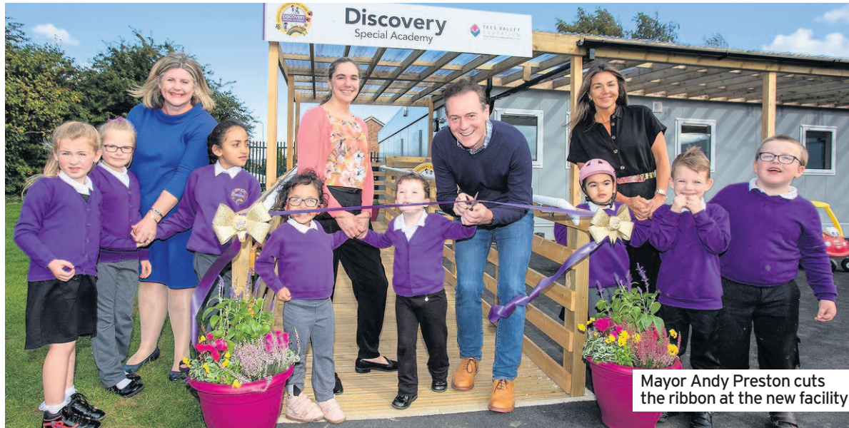
Mayor Andy Preston cuts the ribbon at the new facility

Tees Valley Education Trust’s board when the free school was first applied for, said: “As one of the government’s first free special schools, Discovery is blazing a trail not only for Middlesbrough and Teesside but the whole country.”