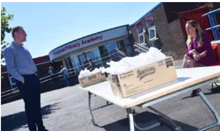
Packed lunches await pupils returning to Pennyman Primary Academy

“We’ll continue to do everything we can to support them and other schools, so parents can send their children back to school with confidence.”