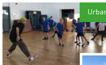
Urban Kaos Street Dance

We are proud to offer a range of after school clubs for the children to enjoy and learn new skills and experiences. This half term these include: